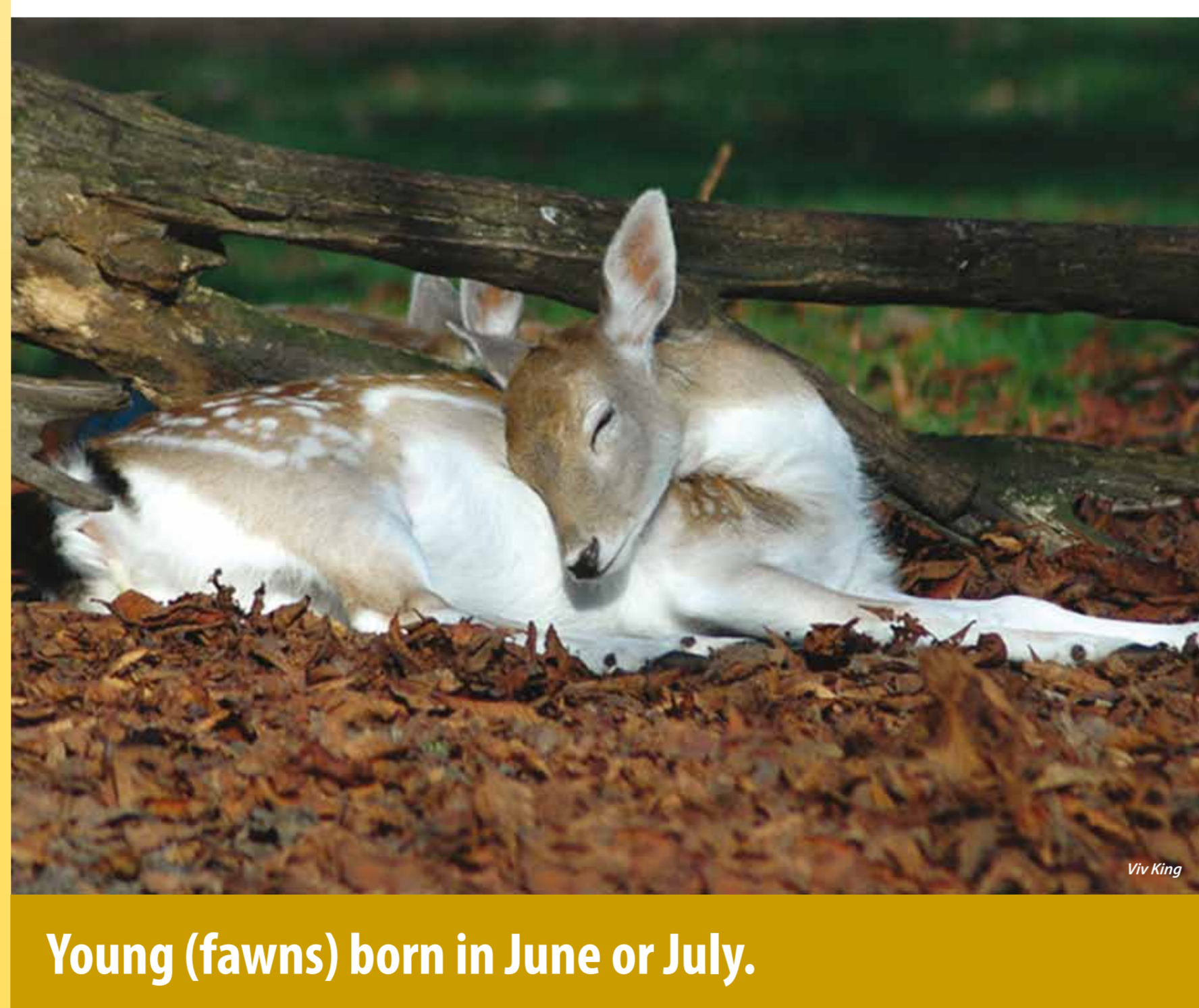
Young (fawns) born in June or July.