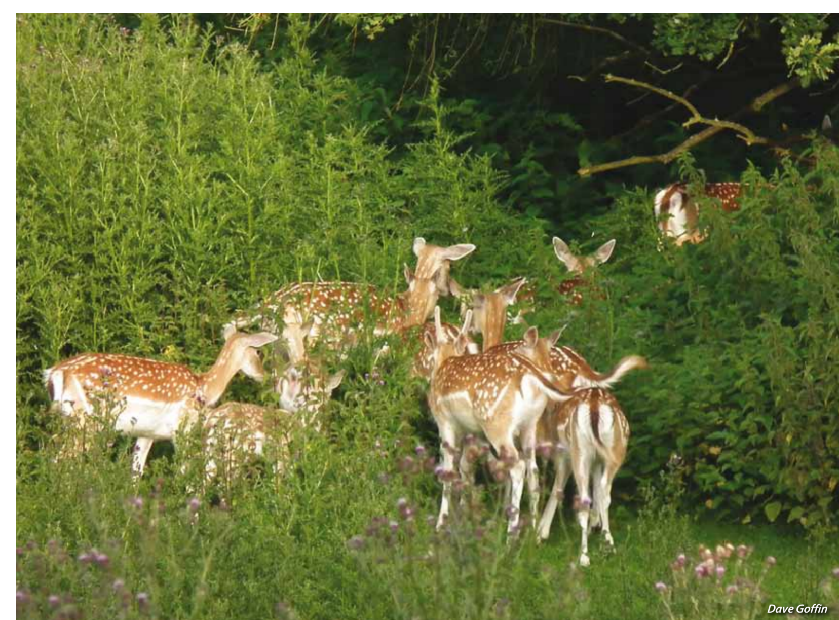
Mainly found in broadleaved woodland with thick low-level vegetation.