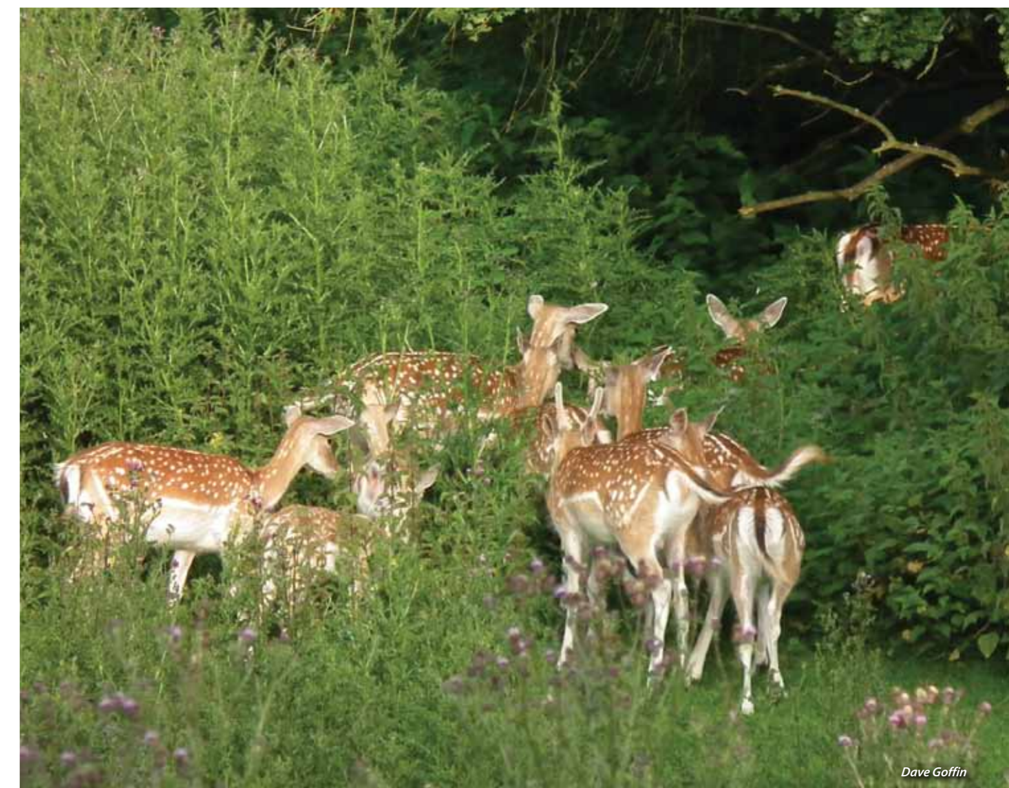
Mainly found in broadleaved woodland with thick low-level vegetation.