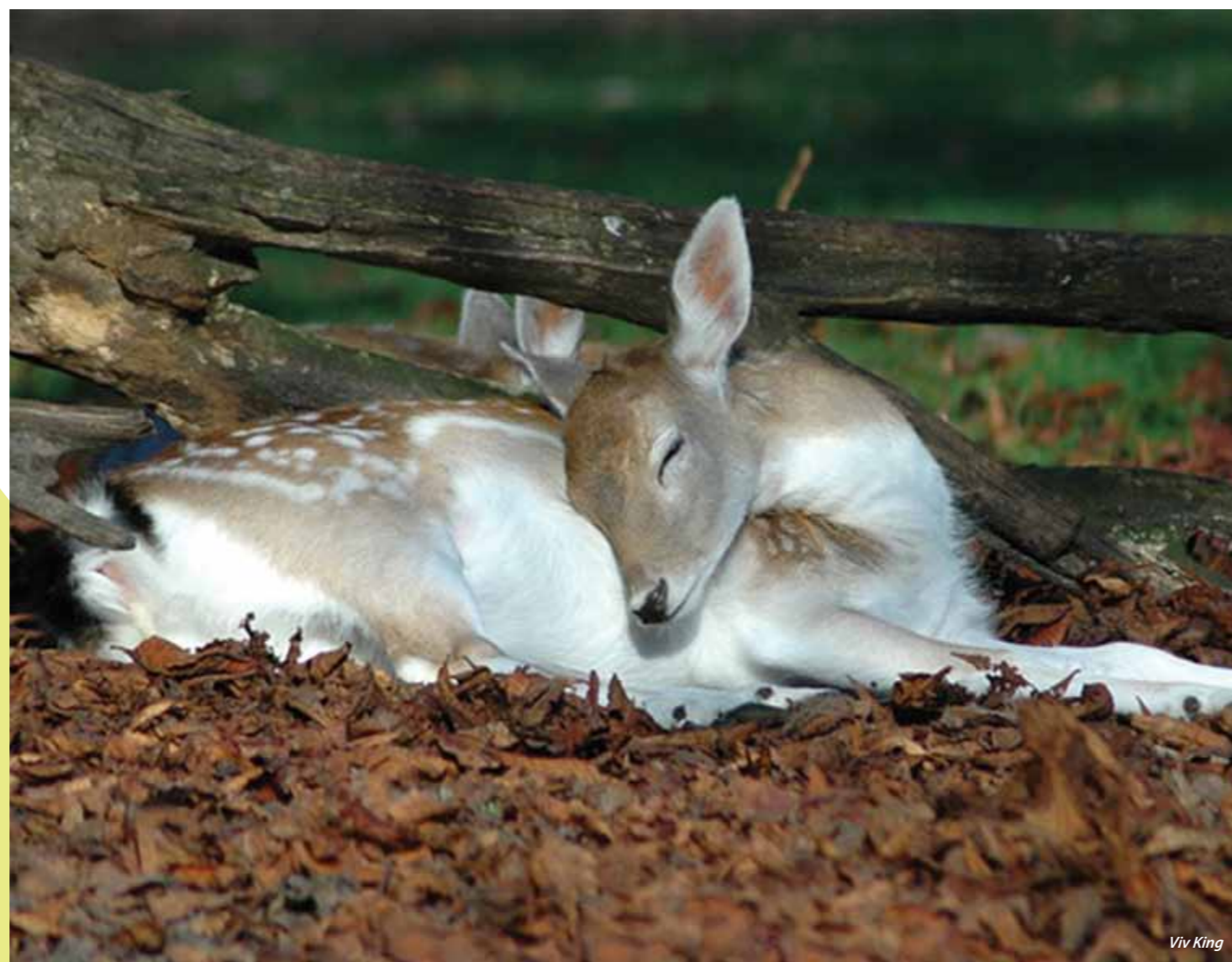
Young (fawns) born in June or July.